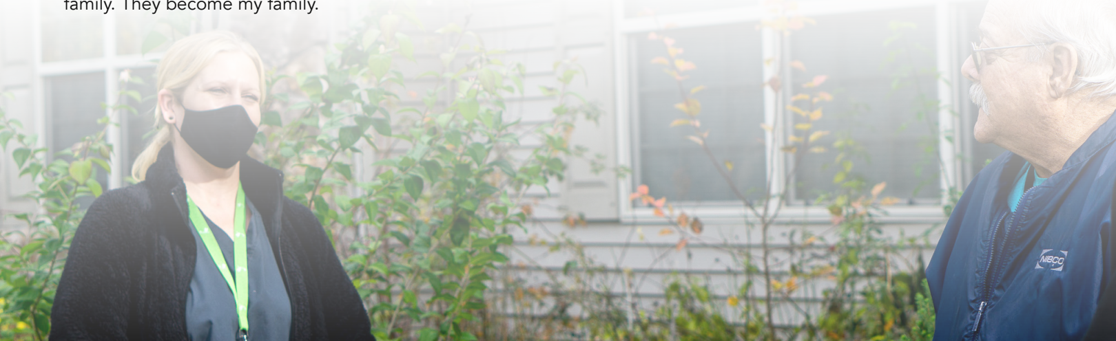
© Firefly Home Care, 2020 | www.fireflyhomecare.com